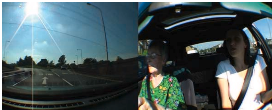
Figure 5. Trouble

There are temporal dimensions to the activities undertaken in each and every mutually intended journey. To rehearse an old travelling aphorism, each journey must have a beginning, middle and an end. These analysable, recognisable and quite mundane features of the journey provide an organisational structure that framed what could possibly be accomplished during a trip by car. On the well-trodden paths recorded in the video clips the driver and passengers initiated talk about a particular matter with a shared sense of how long they had to complete their conversation. They were not conversing ‘in general’; they were always doing something specific like delivering news, telling troubles (Figure 5) or commenting on the conditions of the roads etc. When initiating requests, long or short stories, sharing a joke and so on, they knew how it would likely fit the stage of the journey they were in at the time.