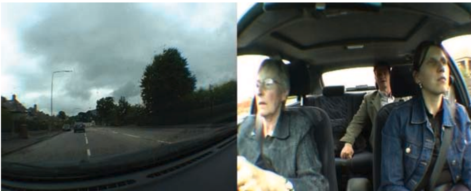
Figure 3. Dying

Under patient examination, the visibility arrangements of bodies between front- and back-seats become apparent as a further oddity of the car as a space for friends, family and colleagues speaking to one another. Conversations between front-seats and back-seats of the car are versed through a spatial arrangement that has those in the rear seats looking at the backs of the heads of those in the front (Figure 3). Even worse, those seated in the front are not positioned to see those in the back at all, unless by uncomfortably craning their necks, or by customised use of the small rear-view mirror and make-up mirror (and eye-to-eye contact using the rear-view mirror was entirely absent from our corpus, though use of the mirror by parents and carers to monitor children in the back was not). Back-seat speakers commonly lean forward (Figure 3) and into the gap between the front-seat speakers to launch or participate in conversations with them. The closing of a conversation was often marked by returning to their previous relaxed seating position in the front. For their part, front-seat speakers would turn their head without actually attempting to secure eye contact