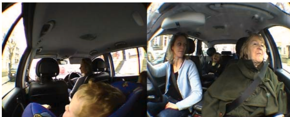
Figure 4. Big/little

settled the argument with remarkable calm. There is, we are only too aware, a familiar routine in these outbreaks of rowdiness from young children in the back seats. A little bit of attention, once secured, leads to a performance which ordinarily ends with some form of calming down, reprimanding or telling off. Then relative quiet returns, at least for a while. What we should not forget is that there are opportunities here; the children are both imaginatively developing their skills of argumentation whilst also being instructed by their parents in the grammar of various concepts (Raffel, 2004). In the example above, of why, although the boy is 'big' for his age, that does not make him his sister's 'big brother'.